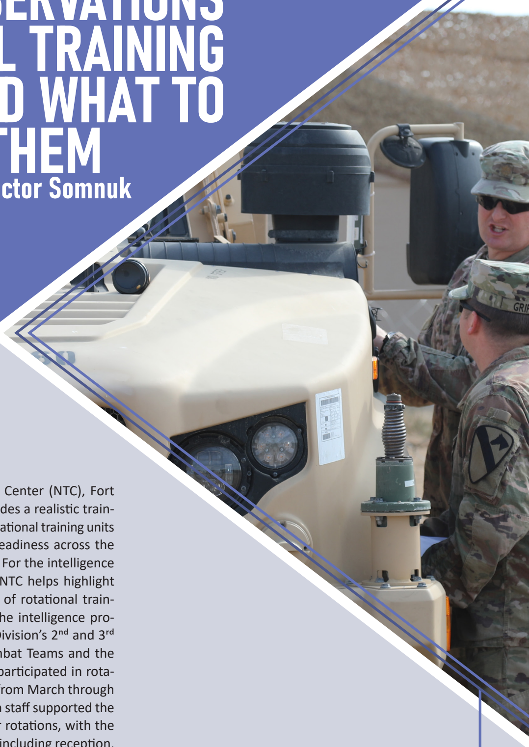
U.S. Army soldiers assigned to the 3 rd Armored Brigade Combat Team, 1 st Cavalry Division, inspect their vehicle during Motorpool Monday at the National Training Center, Fort Irwin, CA.

The National Training Center (NTC), Fort Irwin, California, provides a realistic training environment for rotational training units to build and sustain readiness across the warfighting functions. For the intelligence warfighting function, NTC helps highlight and assess the ability of rotational training units to execute the intelligence process. The 1 st Cavalry Division's 2 nd and 3 rd Armored Brigade Combat Teams and the 3 rd Cavalry Regiment participated in rotational training at NTC from March through May 2022. The division staff supported the units throughout their rotations, with the division G-2's support including reception, staging, onward movement, and integration support teams; soldiers embedded with the units; and reachback to home station for intelligence processing, exploitation, and dissemination support.