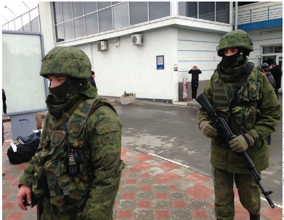
Armed men without insignia (so-called "little green men") at Simferopol Airport, 28 February 2014.

As tensions increased during the Ukrainian crisis in 2014, Knyrik became one of the main organizers on the peninsula and established a tactical informational effort to delegitimize non-Russian narratives. To cognitively isolate the engagement space, Knyrik and a group of militants seized the main informational coordination center of Crimea—the Crimean Center for Investigative Reporting, the region's